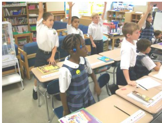
New second graders have it all figured out! (Above) Upper graders are still working on figuring it all out—especially physics (below)

There are families who are leaving all to come join us, families who are split apart or juggling homes in different parts of the country to join us, and high school students who have left mom and dad behind to live with relatives all to gain access to this wonderful school and community. We continue to strive hard to be worthy of the trust and sacrifice of so many. We are not perfect and still struggle with some growing pains, but our spirit and vision are strong!