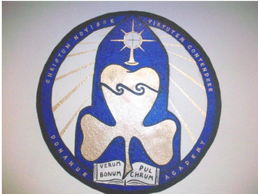
A picture of the large mural of our seal present in our main

Our seal is a valuable teaching tool that lays out our mission. It also expresses our educational philosophy which seeks to assist students to encounter Christ and to learn to see truths in relation to each other. In appreciating they way truths from various academic disciplines illuminate each other and reality, the students will gain a deeper appreciation for the unity of all truth.